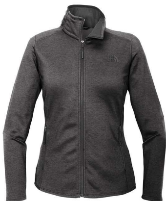
Black 7C & Cool Grey 10C